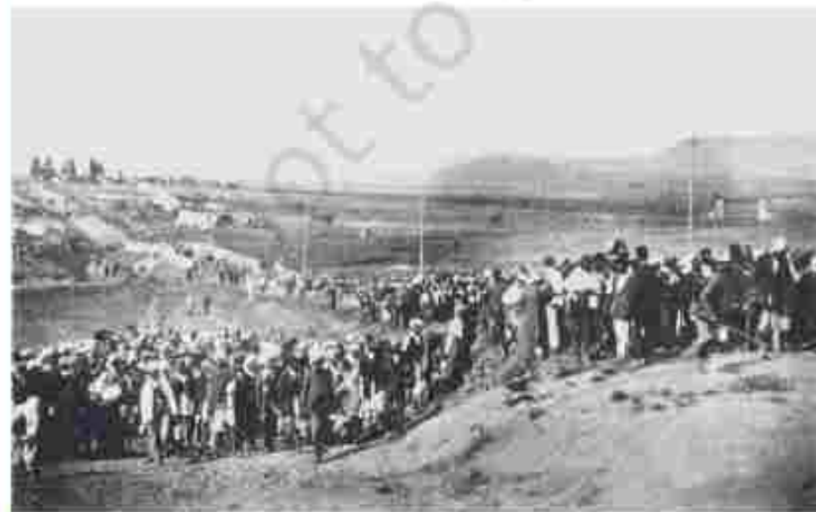
Fig. 2 – Indian workers in South Africa march through Volksrust, 6 November 1913. Mahatma Gandhi was leading the workers from Newcastle to Transvaal. When the marchers were stopped and Gandhi arrested, thousands of more workers joined the satyagraha against racist laws that denied rights to non-whites.

Mahatma Gandhi returned to India in January 1915. As you know, he had come from South Africa where he had successfully fought