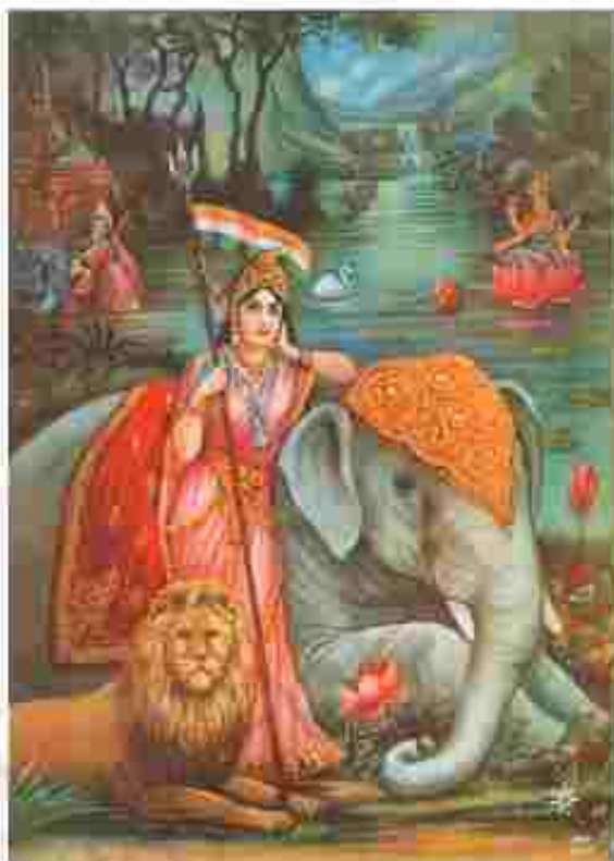
Fig. 14a – Bharat Mata

Tarṇicharan Chattopadhyay, Bharatbarsher Itihas (The History of Bharatbarsh) , vol. 1, 1858.