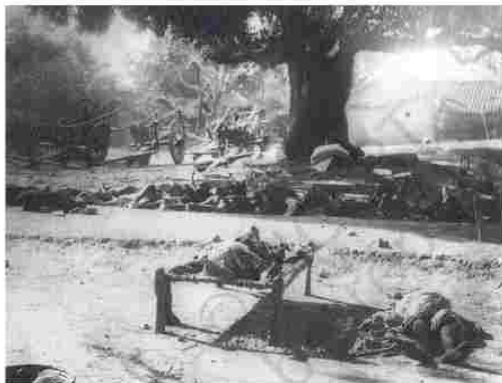
Fig. 5 – Chauri Chaura, 1922

The visions of these movements were not defined by the Congress programme. They interpreted the term swaraj in their own ways, imagining it to be a time when all suffering and all troubles would be over. Yet, when the tribals chanted Gandhi's name and raised slogans demanding ' Iskcontra Bharat ', they were also emotionally relating to an all-India agitation. When they acted in the name of Mahatma Gandhi, or linked their movement to that of the Congress, they were identifying with a movement which went beyond the limits of their immediate locality.