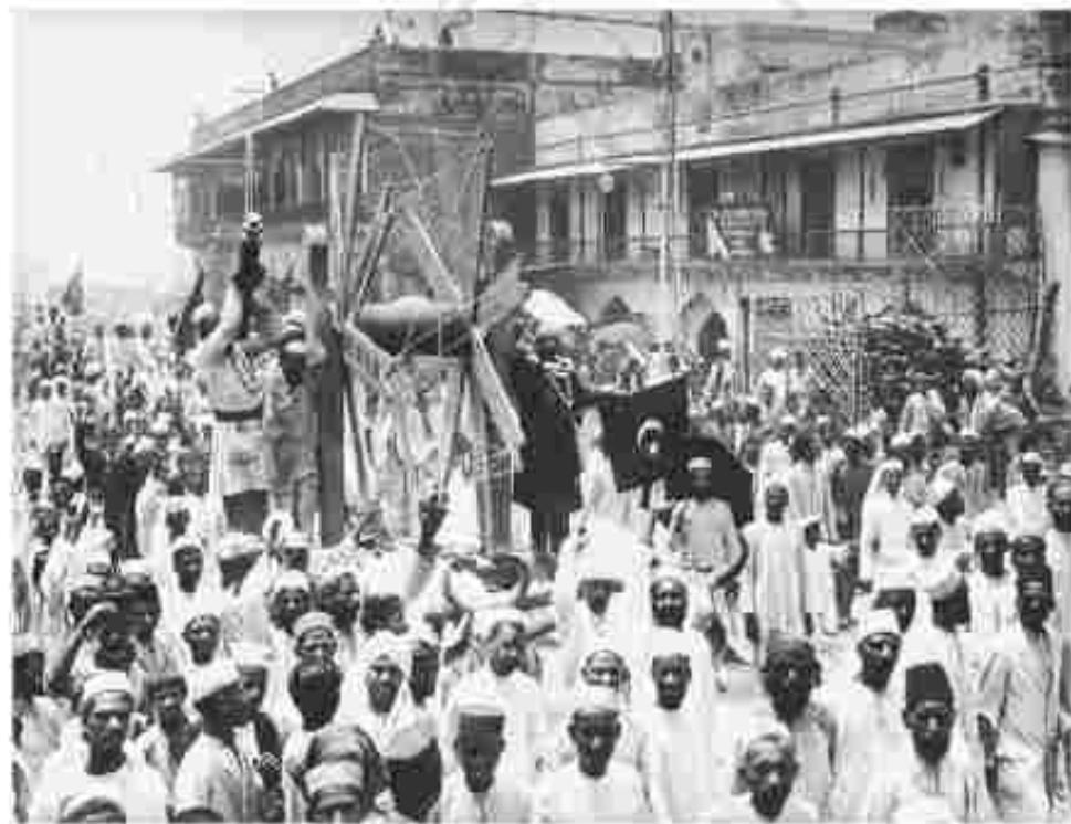
Fig. 4 – The boycott of foreign cloth, July 1922.

Boycott – The refusal to deal and associate with people, or participate in activities, or buy and use things, usually a form of protest