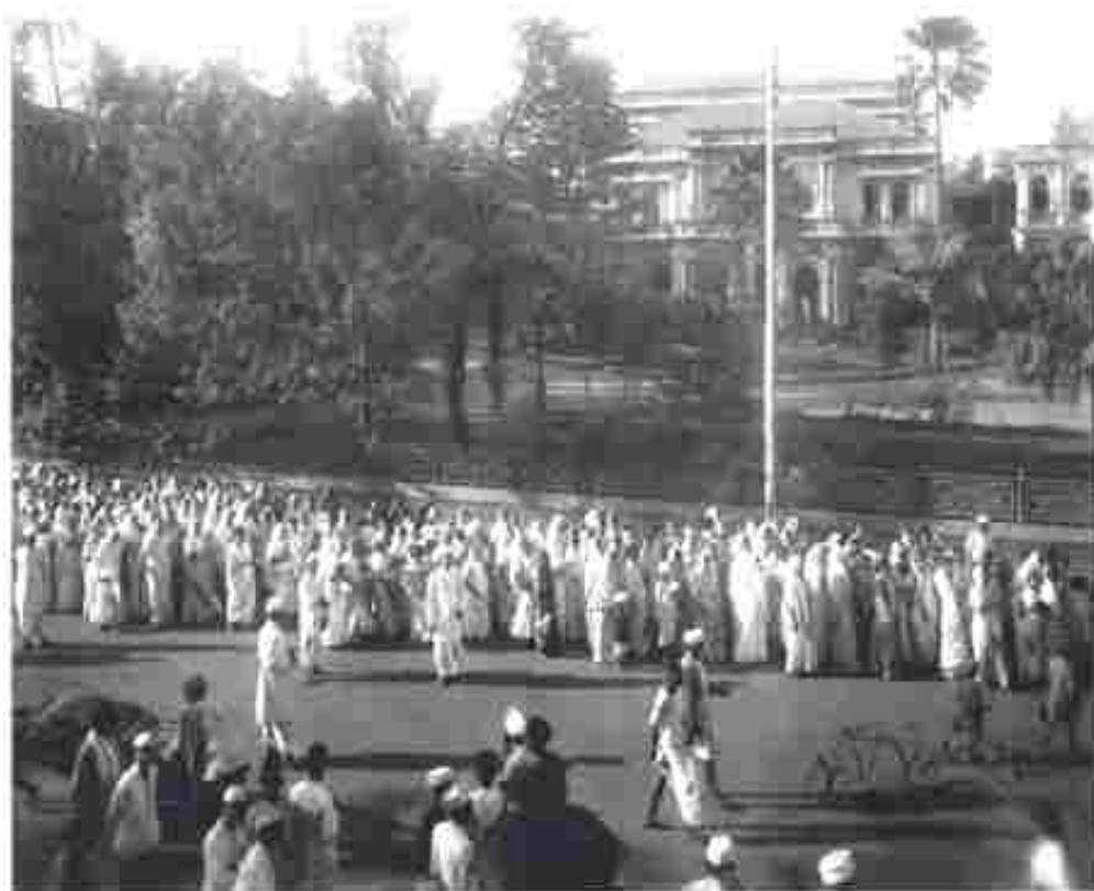
Fig. 9 – Women join nationalist processions. During the national movement, many women, for the first time in their lives, moved out of their homes on to a public arena. Amongst the marchers you can see many old women, and mothers with children in their arms.

picketed foreign cloth and liquor shops. Many went to jail. In urban areas these women were from high-caste families; in rural areas they came from rich peasant households. Moved by Gandhiji's call, they began to see service to the nation as a sacred duty of women. Yet, this increased public role did not necessarily mean any radical change in the way the position of women was visualised. Gandhiji was convinced that it was the duty of women to look after home and hearth, be good mothers and good wives. And for a long time the Congress was reluctant to allow women to hold any position of authority within the organisation. It was keen only on their symbolic presence.