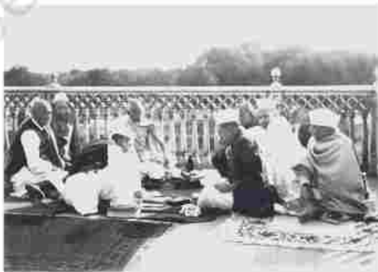
Fig. 6 - Meeting of Congress leaders at Allahabad, 1931. Apart from Mahatma Gandhi, you can see Sardar Vallabhbhai Patel (extreme left), Jawaharlal Nehru (extreme right) and Subhas Chandra Bose (fifth from right).

Lala Lajpat Rai was assaulted by the British police during a peaceful demonstration against the Simon Commission. He succumbed to injuries that were inflicted on him during the demonstration.