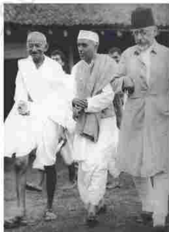
Fig. 10 – Mahatma Gandhi, Jawaharlal Nehru and Maulana Azad at Sevagram Ashram, Wardha, 1935.

The Congress and the Muslim League made efforts to renegotiate an alliance, and in 1927 it appeared that such a unity could be forged. The important differences were over the question of representation in the future assemblies that were to be elected. Muhammad Ali