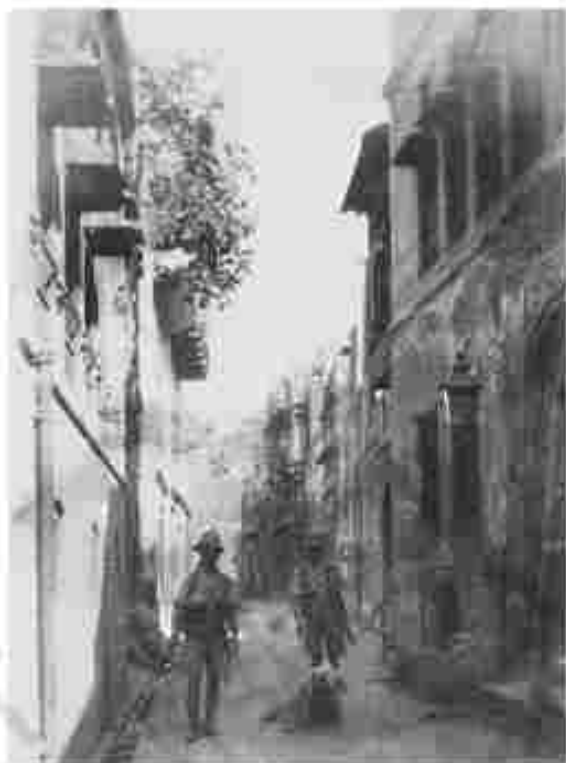
Fig. 3 – General Dyer's 'crawling orders' being administered by British soldiers, Amritsar, Punjab, 1919.

While the Rowlatt satyagraha had been a widespread movement, it was still limited mostly to cities and towns. Mahatma Gandhi now felt the need to launch a more broad-based movement in India. But he was certain that no such movement could be organised without bringing the Hindus and Muslims closer together. One way of doing this, he felt, was to take up the Khilafat issue. The First World War had ended with the defeat of Ottoman Turkey. And there were rumours that a harsh peace treaty was going to be imposed on the Ottoman emperor – the spiritual head of the Islamic world (the Khalifa). To defend the Khalifa's temporal powers, a Khilafat Committee was formed in Bombay in March 1919. A young generation of Muslim leaders like the brothers Muhammad Ali and Shaukat Ali, began discussing with Mahatma Gandhi about the possibility of a united mass action on the issue. Gandhi saw this as an opportunity to bring Muslims under the umbrella of a unified national movement. At the Calcutta session of the Congress in September 1920, he convinced other leaders of the need to start a non-cooperation movement in support of Khilafat as well as for swaraj .