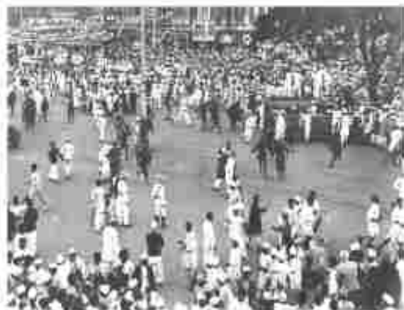
Fig. 8 – Police cracked down on satyagrahis, 1930.

In such a situation, Mahatma Gandhi once again decided to call off the movement and entered into a pact with Irwin on 5 March 1931. By this Gandhi-Irwin Pact, Gandhi consented to participate in a Round Table Conference (the Congress had boycotted the first