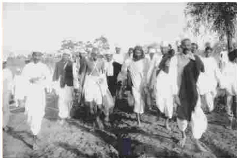
Fig. 7 – The Dandi march. During the salt march Mahatma Gandhi was accompanied by 78 volunteers. On the way they were joined by thousands.

with the British, as they had done in 1921-22, but also to break colonial laws. Thousands in different parts of the country broke the salt law, manufactured salt and demonstrated in front of government salt factories. As the movement spread, foreign cloth was boycotted, and liquor shops were picketed. Peasants refused to pay revenue and chakradar taxes, village officials resigned, and in many places forest people violated forest laws – going into Reserved Forests to collect wood and graze cattle.