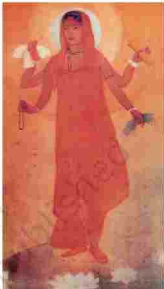
Fig. 12 – Bharat Mata; Abanindranath Tagore, 1905.

Ideas of nationalism also developed through a movement to revive Indian folklore. In late-nineteenth-century India, nationalists began recording folk tales sung by bards and they toured villages to gather folk songs and legends. These tales, they believed, gave a true picture of traditional culture that had been corrupted and damaged by outside forces. It was essential to preserve this folk tradition in order to discover one's national identity and restore a sense of pride in one's past. In Bengal, Rabindranath Tagore himself began collecting ballads, nursery rhymes and myths, and led the movement for folk