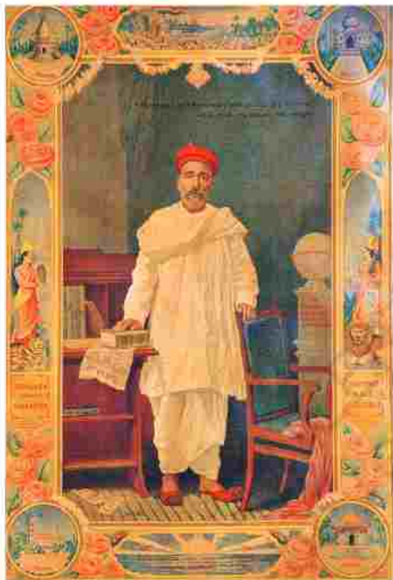
Fig. 11 – Bal Gangadhar Tilak, an early twentieth-century print. Notice how Tilak is surrounded by symbols of unity. The sacred institutions of different faiths (temple, church, masjid) frame the central figure.

Nationalism spreads when people begin to believe that they are all part of the same nation, when they discover some unity that binds them together. But how did the nation become a reality in the minds of people? How did people belonging to different communities, regions or language groups develop a sense of collective belonging?